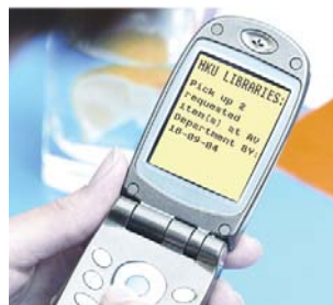
Short Message Service (SMS)

The Internet is now not just something that you use to look for information, send email or to chat, it is now being used in telecommunications. Now that Broadband telephones and videophones are available they open up wider possibilities. Private businesses are now using video telephony for business for example, tele-conferencing via video.